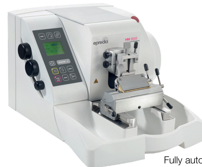
Fully automated HM355S rotary microtome

Optional slide hopper allows for quicker and easier on-demand printing of slides. Slides can automatically feed from the hopper.