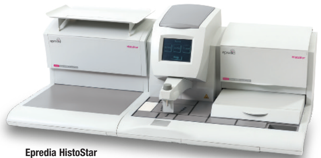
Epredia HistoStar Embedding Workstation